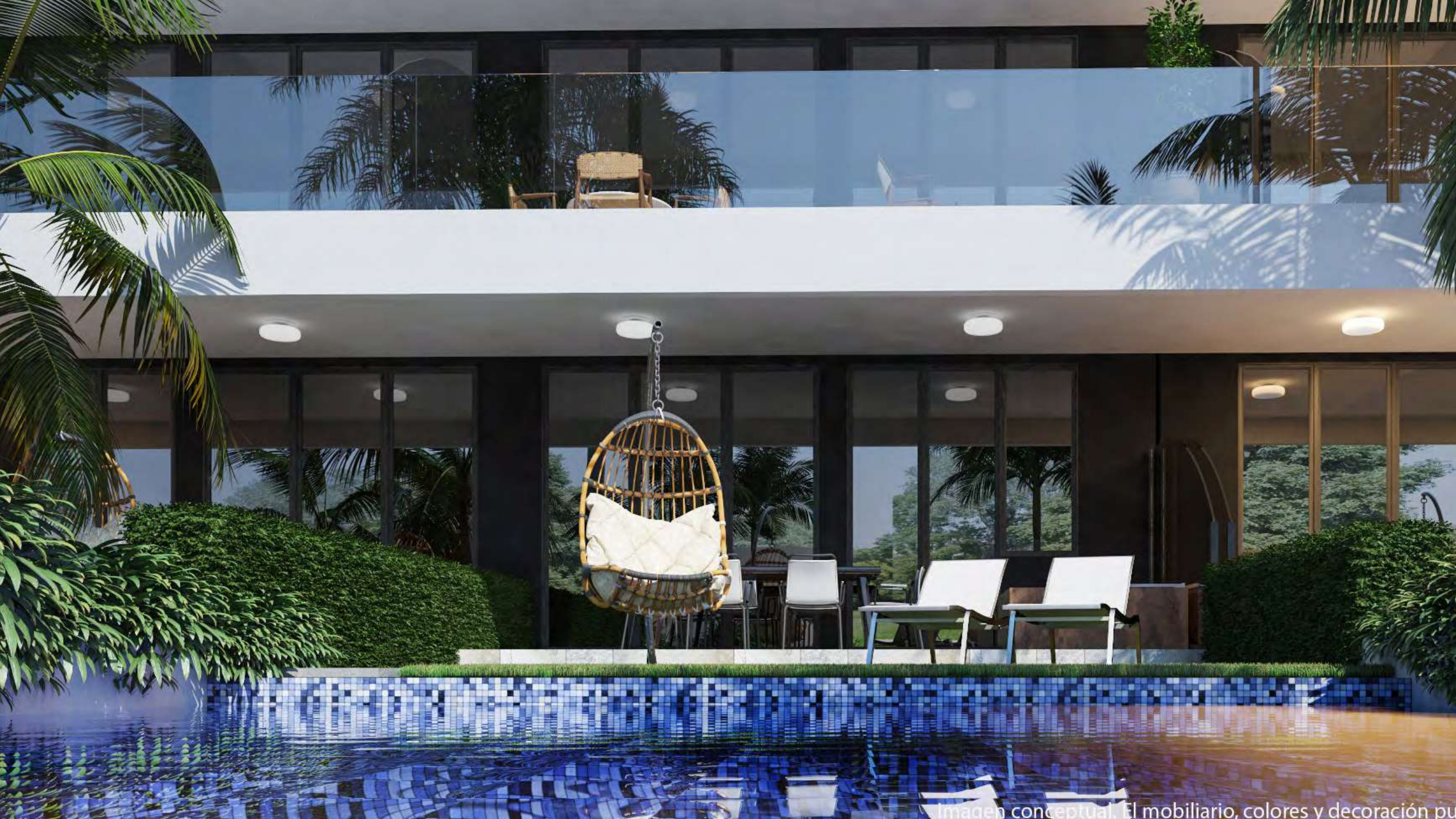
Imagen conceptual. El mobiliario, colores y decoración pu